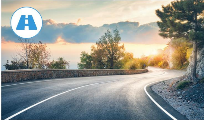
Safety Road Map