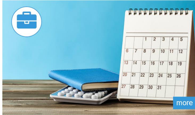
Business Case for Safety